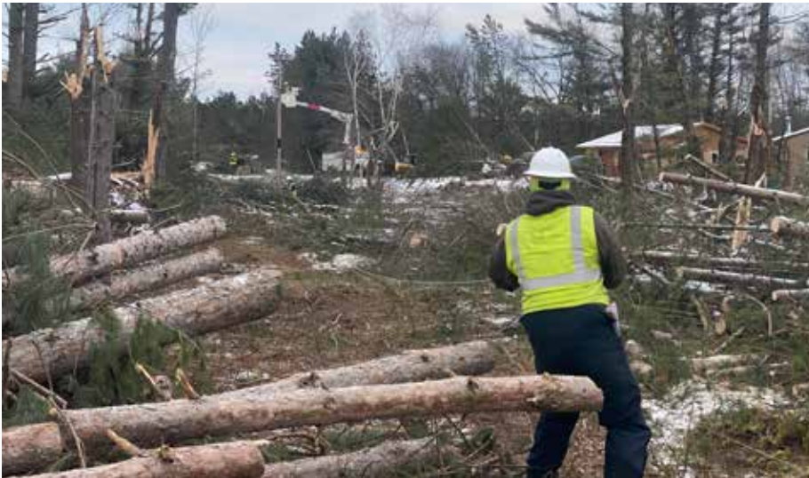
Left: Linemen crew stringing new wire to restore power following December 15 tornado damage. Below: Lineman performing pole top rescue training at safety meeting.