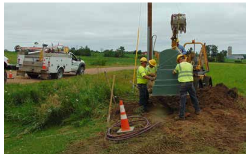
Left: Crews work to restore power following December 15 tornado damage. Right: Linemen setting a URD cabinet for new service.